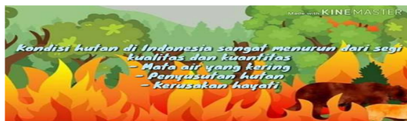
Media Pembelajaran Berbasis Kearifan Lokal Hukum Adat Givu

The development of Givu customary law values is packaged in the design of audio visual learning media by following the current IT development, which is implemented in social studies learning media with the theme of preserving forests in Indonesia. The development of local wisdom of Givu customary law to improve students' ecological intelligence, so that students have an understanding and awareness of the importance of maintaining survival by means of being sympathetic and harmonious not to damage the environment. forest sustainability) through customary law / givu / fines for the survival of future generations. The implementation of givu customary law animation media can be seen in the following display: